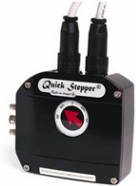
Double Damper Control Unit QS-P2G-BASE-RM-DD