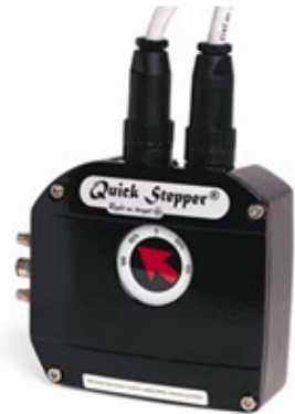
Pneumatic On/Off Control Unit QS-P2G-OO-DA/SA